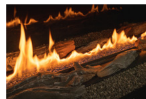
optional ceramic logs or white stones (installed on top of the burner)